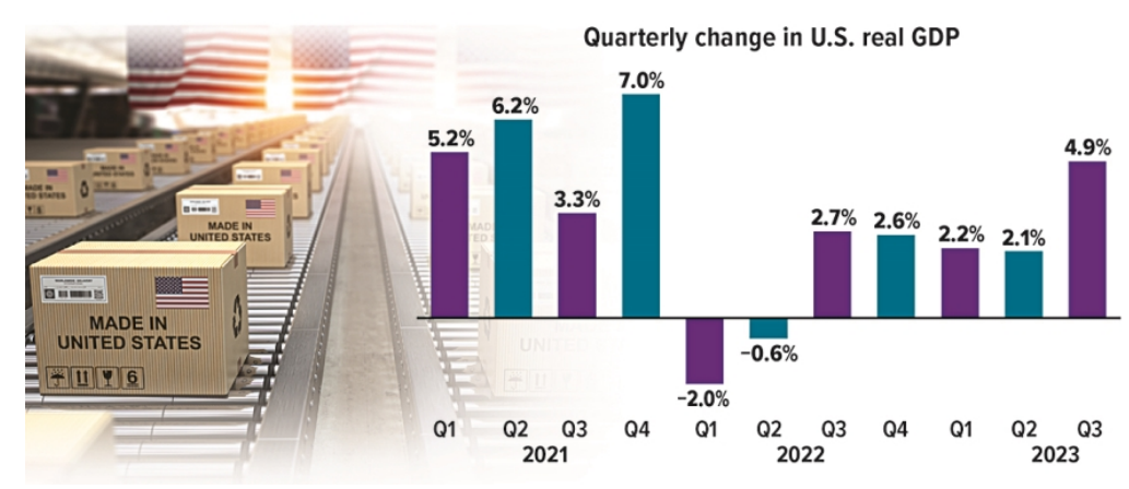
Source: U.S. Bureau of Economic Analysis, 2023 (seasonally adjusted at annual rates; Q3 2023 based on advance estimate)

Current-dollar (nominal) GDP measures the total market value of goods and services produced in the United States at current prices. By adjusting for inflation, real GDP provides a more accurate comparison over time, making its rate of change a preferred indicator of the nation's economic health.